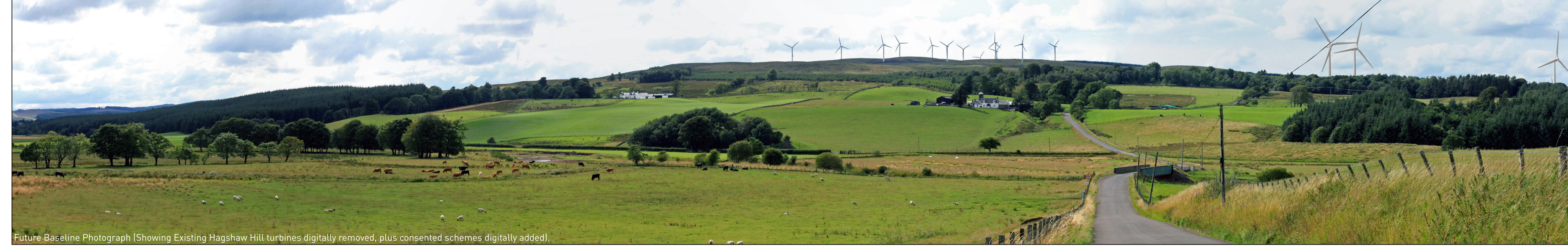
Figure 6.48 (sheet A) Viewpoint 17: Junction of A70 and Station Road, Douglas HAGSHAW HILL WIND FARM REPOWERING