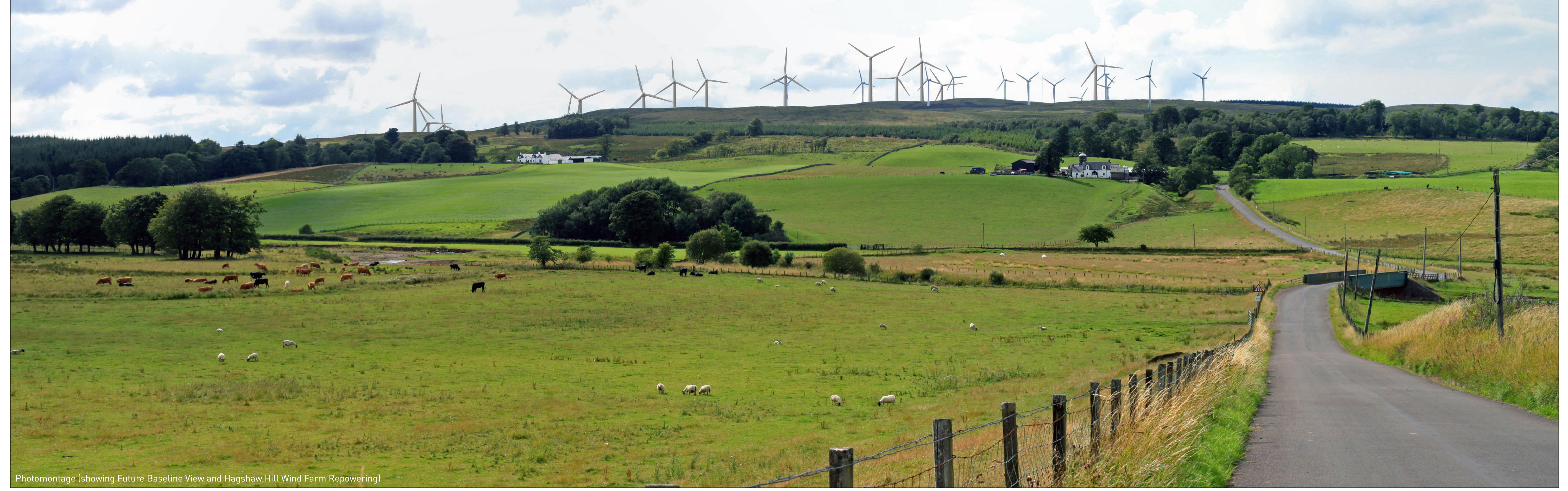
Figure 6.48 (sheet D) Viewpoint 17: Junction of A70 and Station Road, Douglas HAGSHAW HILL WIND FARM REPOWERING